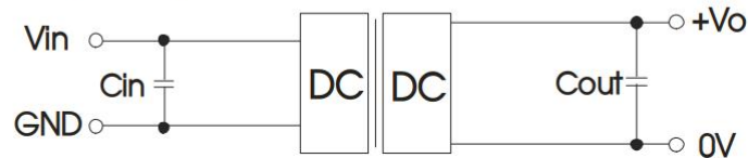
Recommended input and output capacitor values